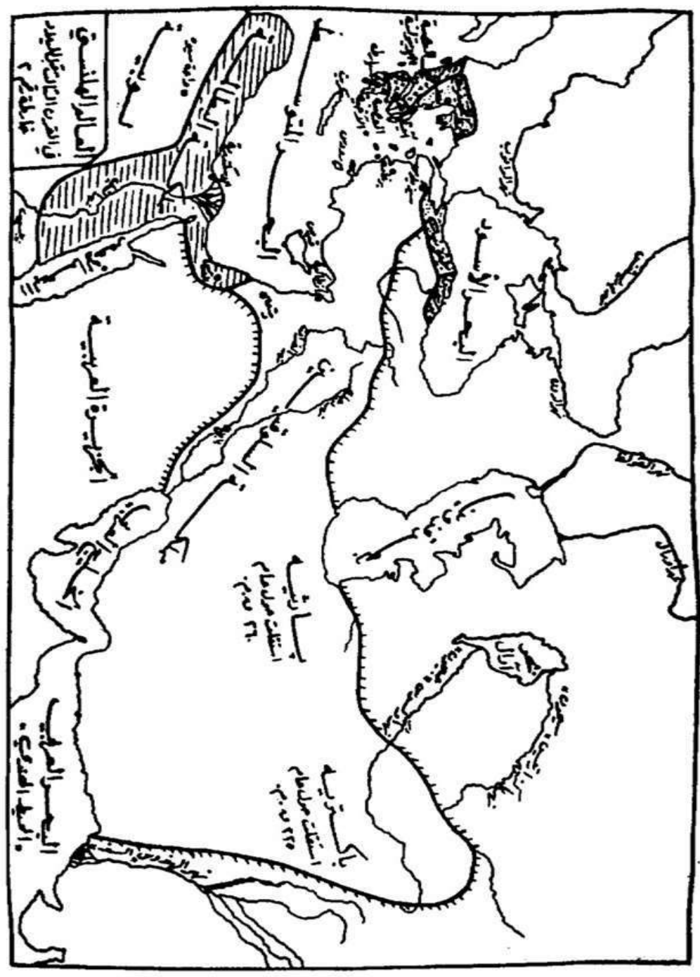
خريطة (1) توضح امتداد الإمبراطورية السليوقية