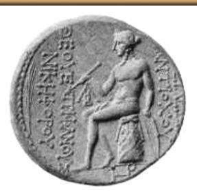
الشكل (2) عملات سليوقية تعود الى الملك انطيوخوس الرابع https://www.marefa.org/images/9/92/AntiochusIVEpiphanes.jpg