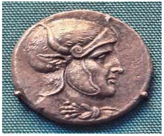
الشكل (1) عملة الملك السليوقي سليوقس الاول

\frac{https://www.marefa.org/images/thumb/a/ab/\%D8\%A8\%D8\%A7\%D8\%B1}{\%D8\%AB\%D9\%8}A\%D9\%88\%D9\%86-1.jpg/800px-