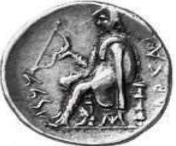
الشكل (4) عملة بارثية تعود الى الملك المؤسس ارشاق الاول (4) عملة بارثية تعود الى الملك المؤسس ارشاق الاول (4) <a href="https://www.marefa.org/images/thumb/1/13/Coin_of_Arsaces_I_of_Parthia.jpg/450px-Coin_of_Arsaces_I_of_Parthia.jpg">https://www.marefa.org/images/thumb/1/13/Coin_of_Arsaces_I_of_Parthia.jpg</a>