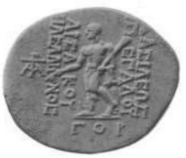
الشكل (3) نماذج من عملات بارثية https://www.marefa.org/images/1/13/Coins_of_Arsaces_I_of_Parthia.jp